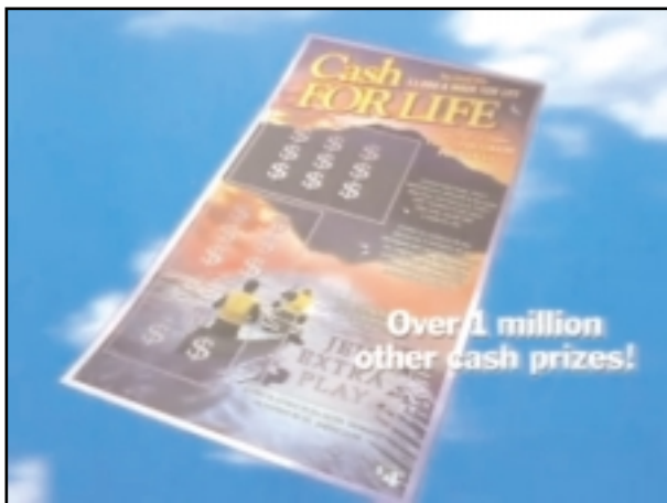
VO: The new Cash for Life Lottery. What would you do with a $1,000 a week for life?