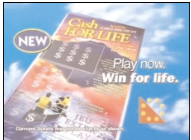
VO: The new Cash for Life Lottery. Play Now. Win for Life.