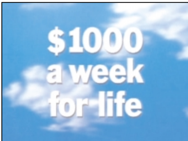
VO: A $1,000 a week for life.