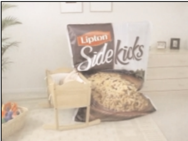
VO: Sidekicks like to help...