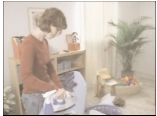
Music. SFX: Baby giggling.