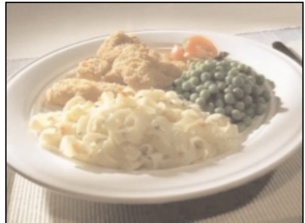
Especially with dinner.