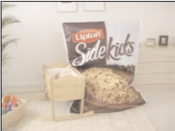
VO: Sidekicks like to help...