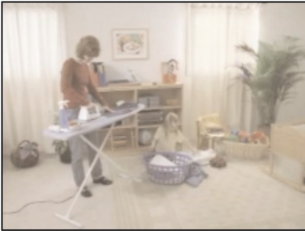
Music. SFX: Baby giggling.

To access the commercials online, click here .