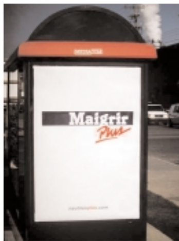
(Be More Thin)

Core creative included Vivre Plus (Live More); S'aimer Plus (Love Yourself More); Sourire Plus (Smile More); and Bouger Plus (Get Around More). Knowing that weight loss is one of the principal motivators to working out, we also installed Maigrir Plus (Be More Thin) posters in bus shelters close to weight-loss clinics around town.