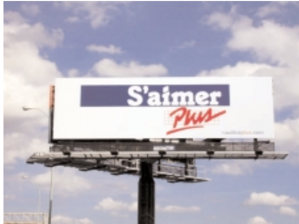
(Love Yourself More)

To maximize media impact, we broadcast our message on the billboards, super boards, and bus shelters of a single media network, focusing the $675,000 budget into the three largest recruiting periods of the year: back to school, New Year's resolutions, and pre-bathing suit season. Moreover, the simplicity of the concept allowed us to optimize the spend between production and media.