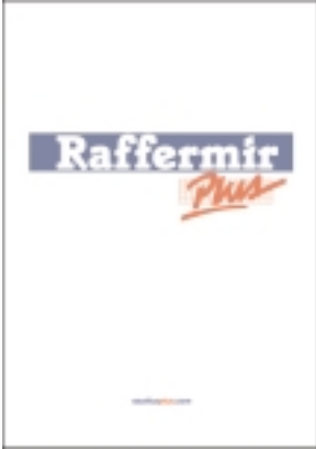
(Get More Firm)

Since our resources were limited, the campaign was French-only, but it obviously had bilingual appeal. According to PMB 2002, 70% of people most often speaking English at home can speak/read French. Of those most often speaking a language other than French or English at home, 78% can speak French at a conversational level.