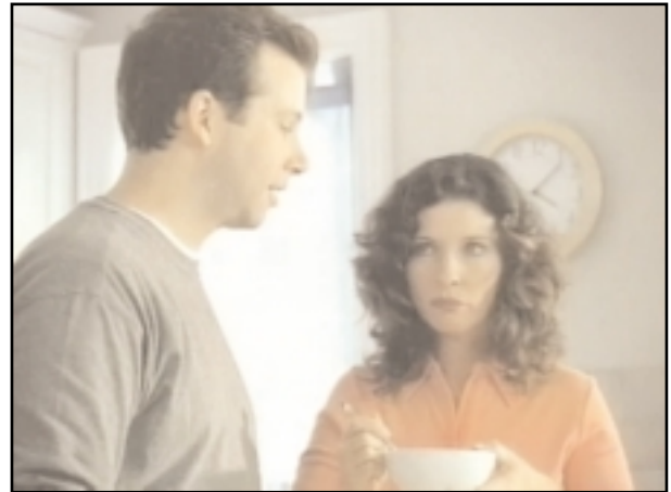
Man. What, are you on a diet?