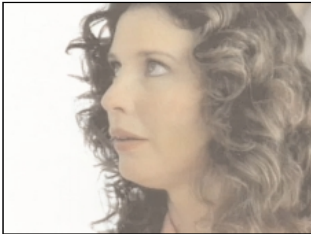
Woman (questioning). No, should I be? Man (innocent) No... wait honey...