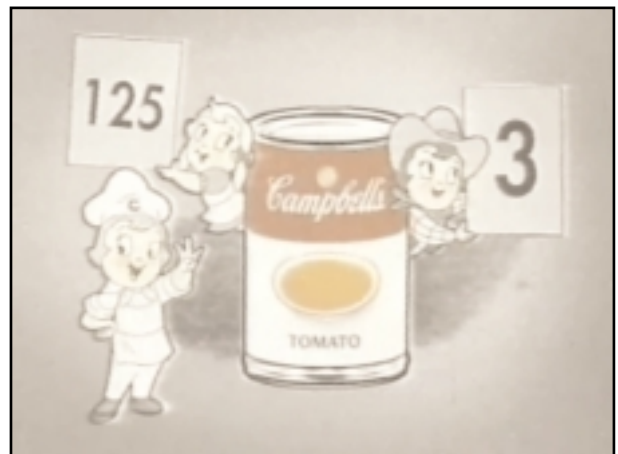
VO: Only 125 calories and three grams of fat in many of your favourite Campbell's soups. Mmm...Mmm...Good.