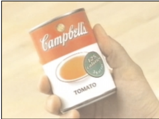
Man. 125 calories. 3 grams of fat.

To access the commercials online, click here .