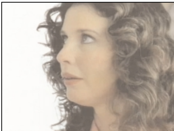
Woman (questioning). No, should I be? Man (innocent) No... wait honey...