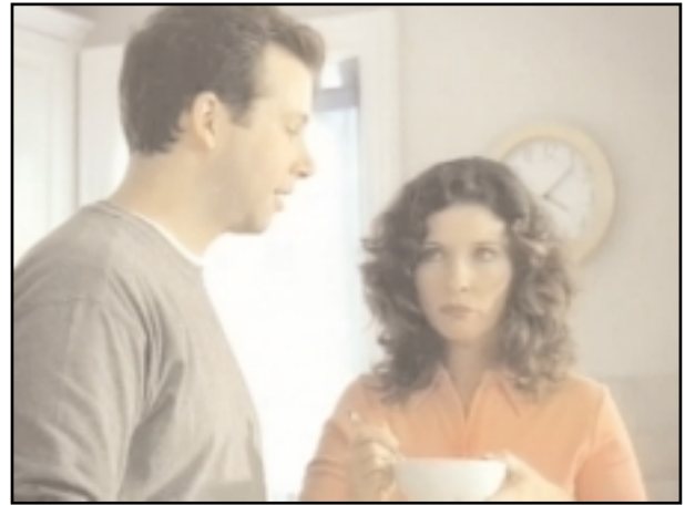
Man. What, are you on a diet?