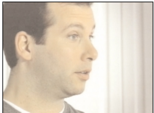
You look great... you look great.